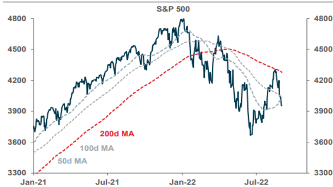
CIO Office (data via Refinitiv)

On the bullish side, the central scenario calls for a rapid slowdown in inflation and a gradual slowdown in wages, allowing the purchasing power of households – which are otherwise in excellent financial health – to strengthen and enabling the Fed to renew with less constraining monetary policies. Some recent data tend to support this thesis, but nothing definitive.