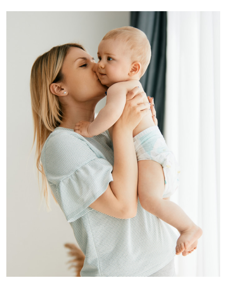
Note to Quebec residents: The QPP offers a similar provision. The period that the QPP pension amount is based on can exclude the months when your child was under age 7 and your employment income didn't exceed the basic exemption.

You can apply for the child-rearing provision at the same time you apply for CPP benefits. If you're already receiving CPP payments, you can still request the provision.